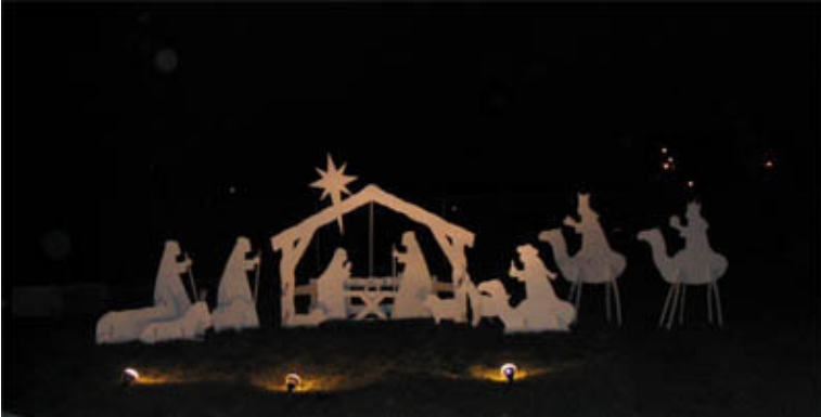
St Wenceslaus --Czech Heritage Park

For unto us a child is born, Unto us a child is given A precious baby sent by God, Let all creation give him praise